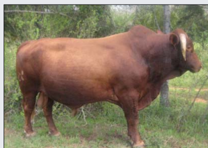
Our Top User having just finished inspecting the cattle herd for Demuscus beef Project which received three Nguni Bulls from the Department Livestock Scheme, the project is in Humansdorp under Kouga Municipality.