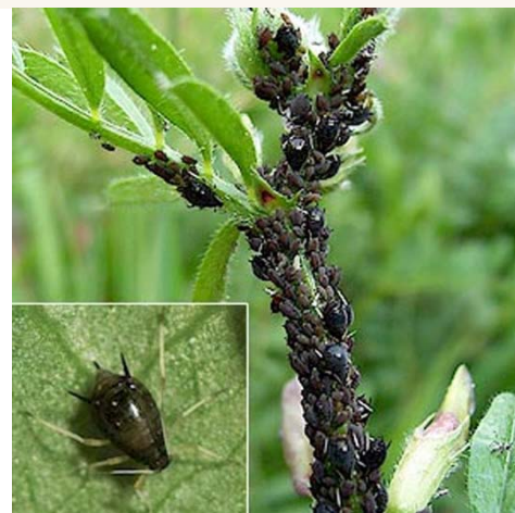
Black Legume Aphid on Garden Beans

Aphids are small delicate pear-shaped insects with soft bodies, long whitish-cream legs and antennae. They are bluish-green to blackish, with or without wings and are normally found in small colonies sucking sap of tender growth.